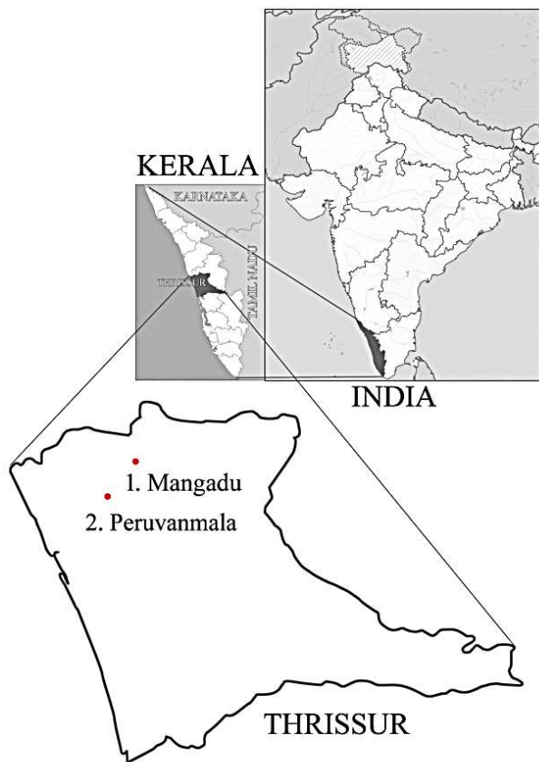
Fig. 3. Distribution of Parthenocissus renukae sp. nov.

Notes: This is the only species having simple leaves and 4-5-merous flowers in the genus Parthenocissus . The floral morphology of this species shows an intermediary position between Cissus and Parthenocissus .