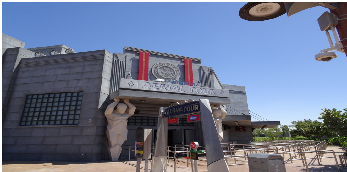
Panem Aerial Tour, Motiongate Dubai

The depth and reach of the novel and film series is evident from the attraction Motiongate Dubai. We have seen many theme parks, roller coasters and adventure sets of blockbuster movies in different parts of the world. Jurassic Park, Pirates of the Caribbean and Harry Potter are some prime examples. Disneyland is also spread around the globe with attractions in North America, Europe, Asia and Oceania. Our series in discussion, The Hunger Games also makes it to this list with the attraction in Dubai called The World of the Hunger Games. Except Harry Potter and The Lord of the Rings series, any of the young adult or Children's literature series has an attraction on its own. This adds up to the success story of The Hunger Games book series.